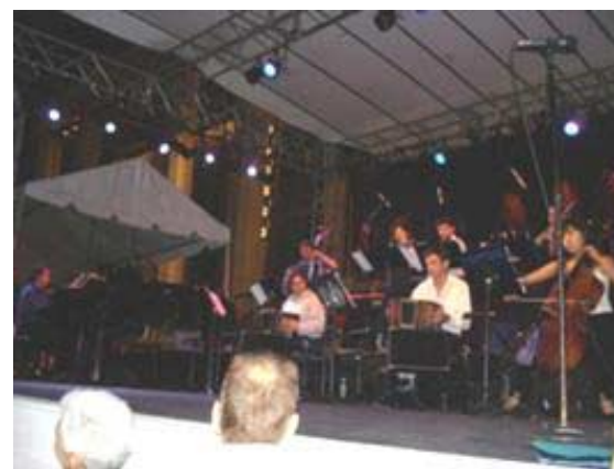
*Eternal Tango Orchestra performing at Lincoln Center Midsummer Night Swing Festival, July 2005.

There will be a big dance floor for you to express yourself with live music of Eternal Tango Orchestra. For more details, visit my calendar .